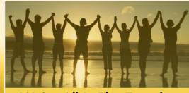
We're All In This Together